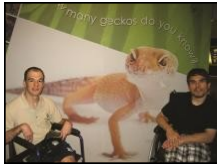
Berkshire Museum, Pittsfield, MA