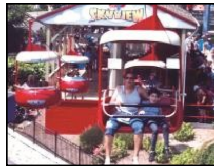
Hershey Park, Pennsylvania