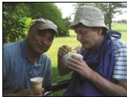
Krispy Cone, Lanesboro, MA