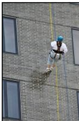
Many, many thanks to people that helped me achieve my fundraising goal!