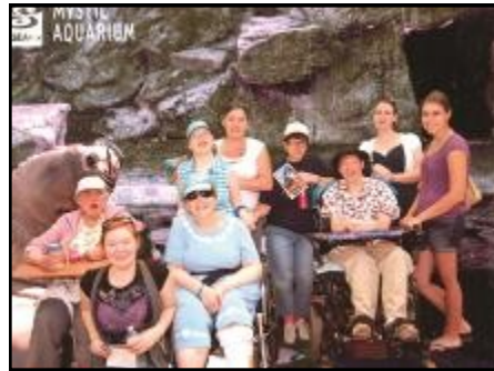
Mystic Aquarium, Mystic, CT