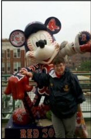
Fenway Park Boston, MA